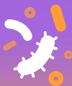
Weakened immune systems after other diseases